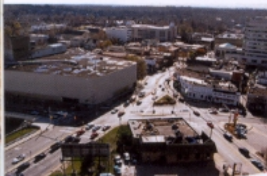
Before the roundabout was built, the gateway to Towson was dominated by cars waiting in long lines at traffic lights.