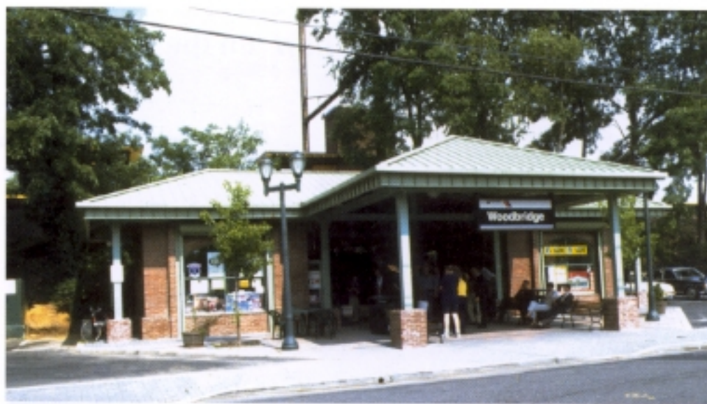
NJ Transit's Woodbridge Train Station is one of many new stations now serving as a focal point for community life in New Jersey.

Spurred by the success of its 1998 national conference, "Thinking Beyond the Pavement," the Maryland State Highway Administration is changing the way it does business. Since 1998, MSHA has embarked upon and completed about a dozen context-sensitive design projects, focusing on places where state highways serve as main streets, arterials, and scenic byways; 22 more projects are currently underway, as are staff training efforts, agency-wide. Maryland is one of five states that are implementing model context sensitive design programs.