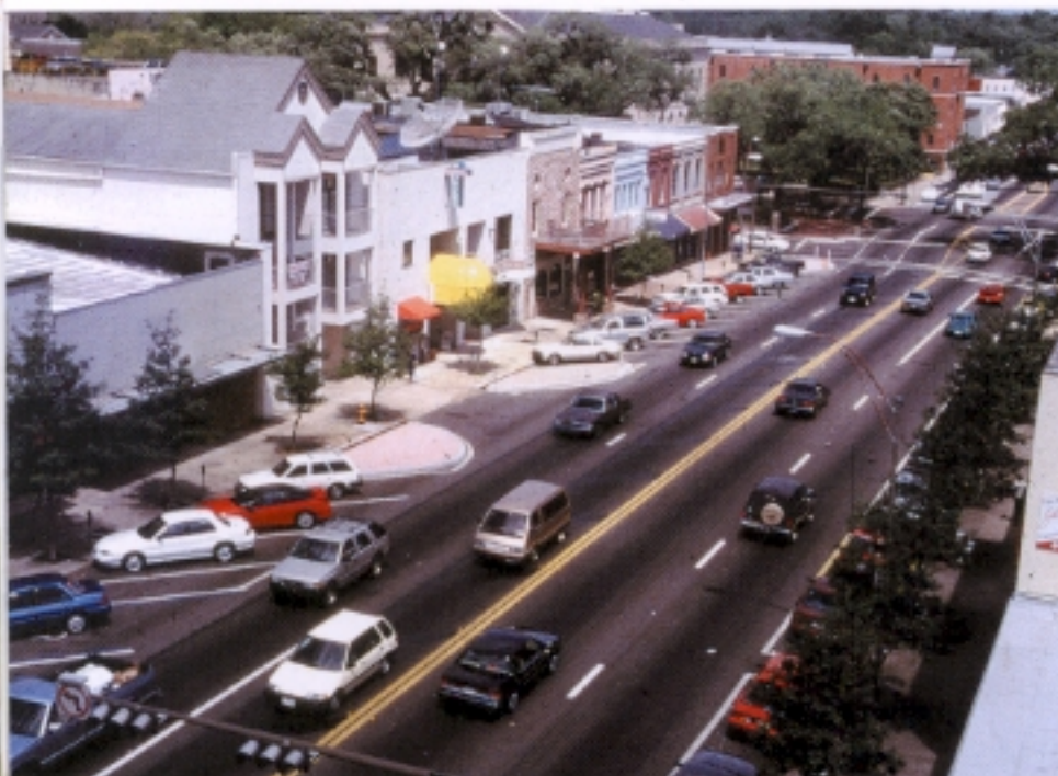
Monroe Street, Tallahassee, Florida

“State DOTs... paving the way for people-friendly places.”