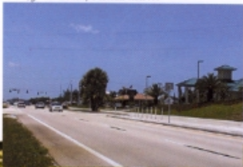
US1, Juno Beach, Florida now...

... and as envisioned by the Treasure Coast Regional Planning Council.