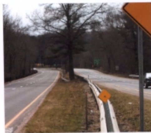
Before improvements, steel guardrails predominated

These efforts have guided parkway improvement. A maintenance, restoration, and preservation program divided the roadway into segments and phases for