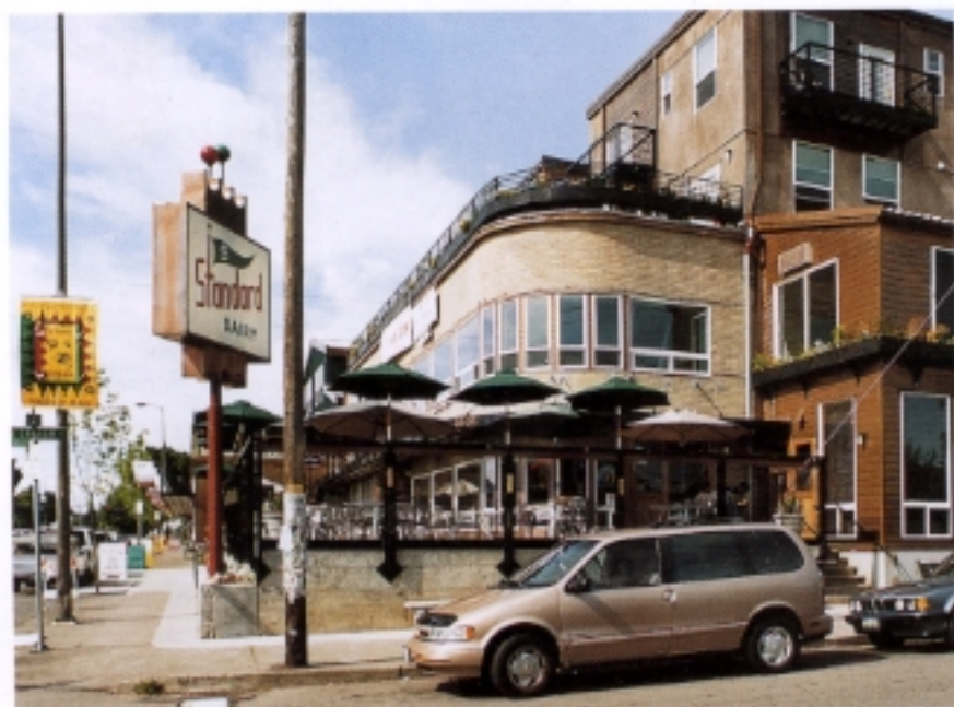
With on-street parking restored and the street accessible to walkers, new businesses, and neighbors, have been moving in.

In response, the plan provided for several different options. The most extensive change bolstered commercial nodes by restoring on-street parking on both sides, narrowing traffic lanes down to ten feet, and building a "mini-median" whose four feet would provide refuge for pedestrians and space for plantings. A second option retains the wider medians with their mature trees and greenery in resi-