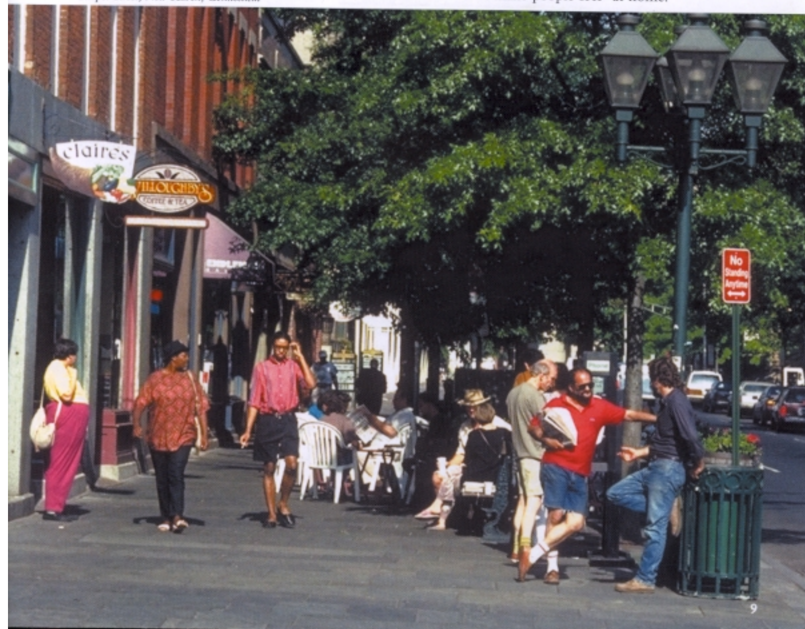
Chapel Street, New Haven, Connecticut

Urban streets, although they exist in a larger context, can also be Main Streets. In cities, they serve as neighborhood commercial districts, but when functioning correctly, they perform the same role as any other Main Street — as centers of community life, where local people come to shop, do errands, get together, and enjoy leisure time. And like other Main Streets, these urban cousins need to be geared to serve the business and residential needs of their communities: by accommodating traffic yet keeping it moving slowly enough to give pedestrians the comfort and safety that they need to get around; by providing adequate parking, but also offering other travel options; and by offering amenities and enhancements that make people feel “at home.”