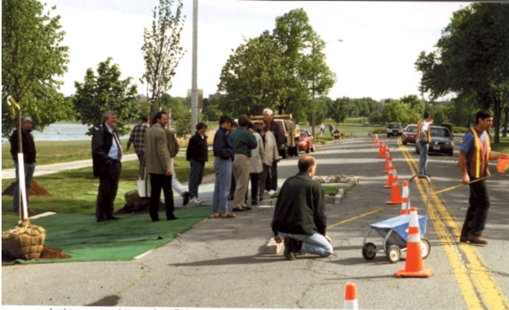
An advisory committee of citizens and city officials oversee the testing of an alternative design for Baxter Boulevard in Portland, Maine.

This document was produced by Project for Public Spaces, Inc. (PPS). Unless otherwise noted, all photos © Project for Public Spaces, Inc.