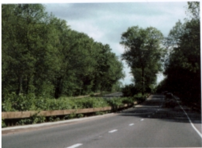
An advisory committee helped design a guardrail that was more appropriate to the parkway's historic context.