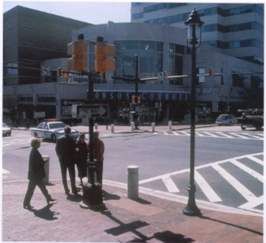
Baltimore County Public Works' streetscape plan extended the amenities and landscaping treatments from the roundabout westward into the center of town, where they slow the approach of traffic into the circle, while stimulating renewed foot traffic for local businesses.