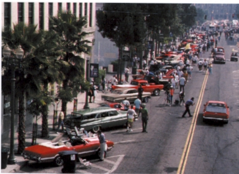
The Route 66 Festival in San Bernardino, California takes advantage of new angled parking downtown.