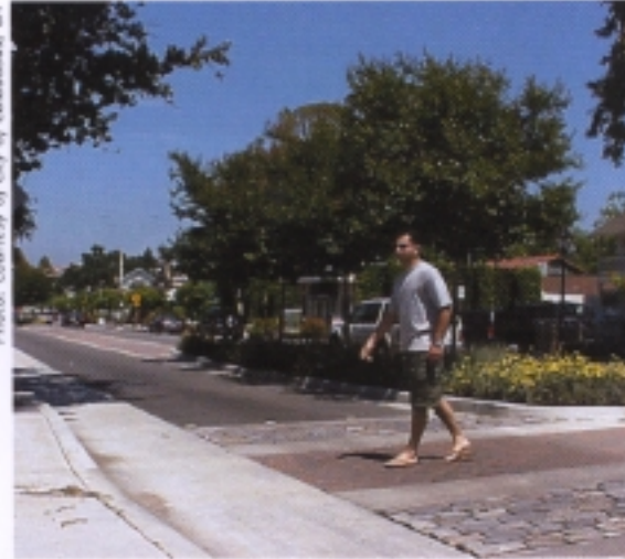
The landscaped medians are a refuge for pedestrians while the cobblestoned pedestrian crossings are just one element of the roadway design that physically reinforces the design speed of Calabasas Road — 25 mph.

Old Town Calabasas is a "picture postcard" example of what can be achieved by state highway officials, local traffic departments, and municipalities working in partnership to realize common goals.