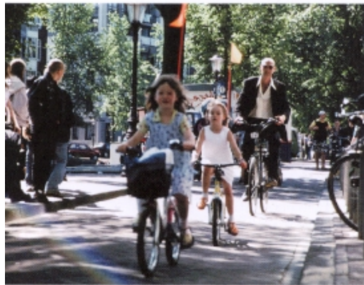
Ocean Avenue, Belmar, New Jersey