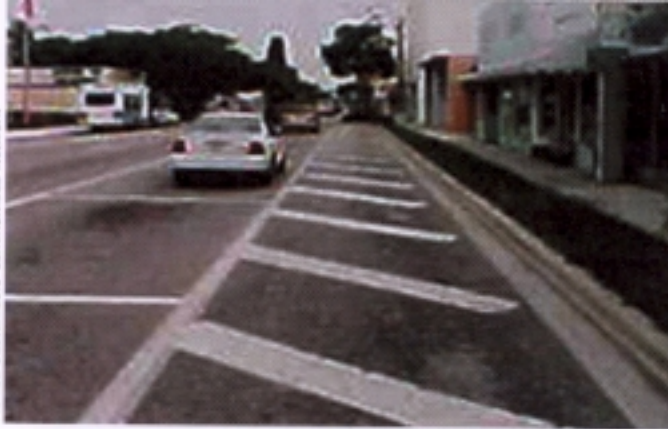
Before: FDOT tested how two lanes would work by "striping out" the third one. Accident rates fell by over 44%.

containers, and other amenities in "you're in Lake Worth now" colors. Both streets also received 65-foot corner "bumpouts" that shorten street crossings for pedestrians and serve as convenient stops for the county bus and the "Lolly the Trolley" minibus. A westbound bike lane was added to Lucerne Avenue, and an eastbound lane was added on an adjacent street. Lake Avenue, Lake Worth's bonafide "Main Street," received widened sidewalks, including two blocks of 21-foot sidewalks at a point where a broader roadbed could be whittled down for more pedestrian space.