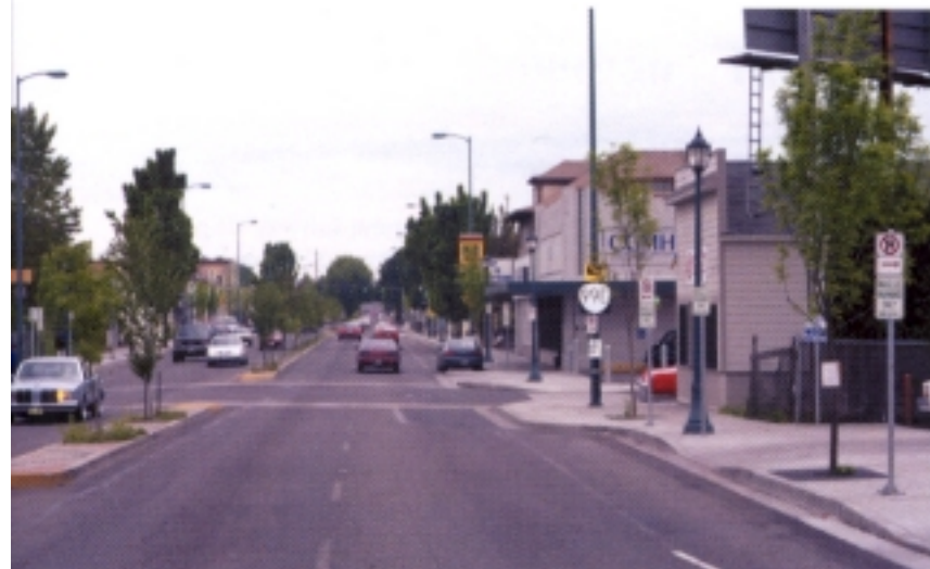
The narrowed traffic lanes, mini-medians, curb extensions, ornamental light posts and extra trees ...

dential areas where most people preferred this enhancement. Since these same residents also wanted to cross the street more easily, the lengthy medians have been opened up at every traffic signal for safer pedestrian crossing. The original experimental area where the median was removed has been temporarily retained. "It was difficult to convince some ODOT engineers about these changes," says Matt Brown, of Portland's Office of Transportation, especially since ODOT's own design standards are stricter than the range of design guidelines in the AASHTO Greenbook, generally accepted as the "bible" of state highway engineers. However, Grace Crunican, the new state transportation director was, according to ODOT's Dan Layden, willing to use the minimum AASHTO guidelines instead of the stricter state standards, and sought and received a design exemption for the elements that needed it. "The governor's help was also invaluable in giving this project priority," added Layden.